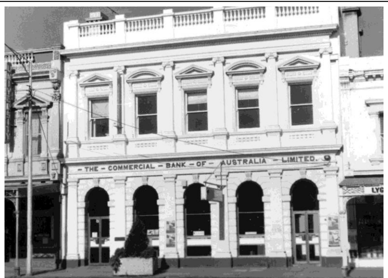
The Commercial Bank of Australia, 259 Lygon Street, Carlton in 1975. This building later became the Carlton branch of the Commonwealth Bank of Australia.