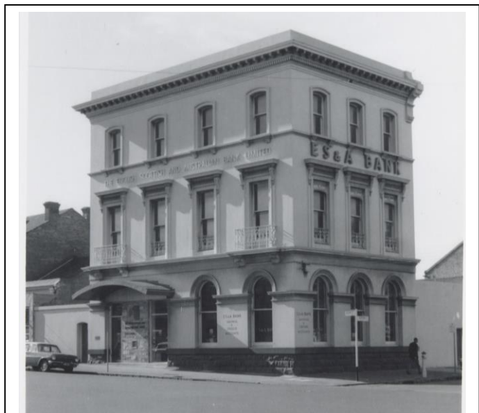
One of Carlton's surviving former bank buildings, on the corner of Elgin and Drummond streets. In 1963 when this photo was taken, it was a branch of the ES&A Bank.

In June 1864, a group of residents and other interested people met at the orderly room of the Carlton Rifle Brigade in Grattan Street to discuss establishing a 'penny' savings bank in Carlton. Penny savings banks were community banks managed by volunteers and overseen by trustees, who accepted small deposits from children and low income adults, then invested the bulk amount in a mainstream bank. In that way, depositors were able to earn interest and grow their capital, however small. The aim was to encourage a savings habit, which was considered important to one's moral development. The bank opened for business in July 1864 and initial deposits amounted to £53, 13 shillings and 10 pence. This was invested in the London Chartered Bank at an interest rate of 6 percent, 1 percent of which was deducted to cover expenses. After a year of operation, as reported in The Herald in July 1865, the Carlton Penny Savings Bank had 719 current depositors and a bank balance of £722, 4 shillings and 2 pence. This proved to be the first and only annual report of the Carlton Penny Savings Bank. A few months later, in November 1865, the same newspaper carried a short public notice informing depositors '... that this will be the last opportunity they will have of withdrawing their money'. The Carlton Penny Savings Bank, established with the best of intentions, had ceased operation.