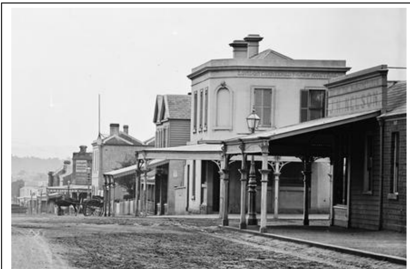
The first Carlton branch of the London Chartered Bank, on the corner of Lygon and Faraday streets in the 1870s. This view is looking east along Faraday Street.

In a letter to the editor of The Herald in July 1876, the manager of the Commercial Bank of Australia politely disputed a statement that the London Chartered Bank was the first bank branch in Carlton. The occasion was the impending opening of the new three-storey bank building on the corner of Elgin and Drummond streets (see photo page 1). Three years earlier, in August 1870, the London Chartered Bank had a more humble introduction in Carlton. The bank opened for business on the south east corner of Lygon and Faraday streets, just north of the Commercial Bank of Australia, which had opened in October 1868. The four-roomed shopfront was a rental property and half the size of its nearest competitor. The move to the new purpose-built premises on the corner of Elgin and Drummond streets made a bold statement of the bank's investment in Carlton.