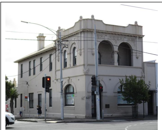
This building on the corner of Nicholson and Richardson streets was formerly the North Carlton branch of the ES&A Bank.