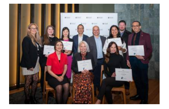
VIC 2022 Awards Ceremony - view the photos.

SA 2022 Awards Ceremony - view the photos.