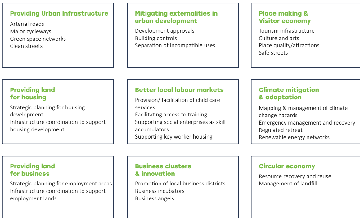
Figure 1 – Nine ways local governments contribute to the productive capacity of the broader economy:

Sources: Adapted from SGS Research for ALGA’s Submission to Productivity Commission (2022)