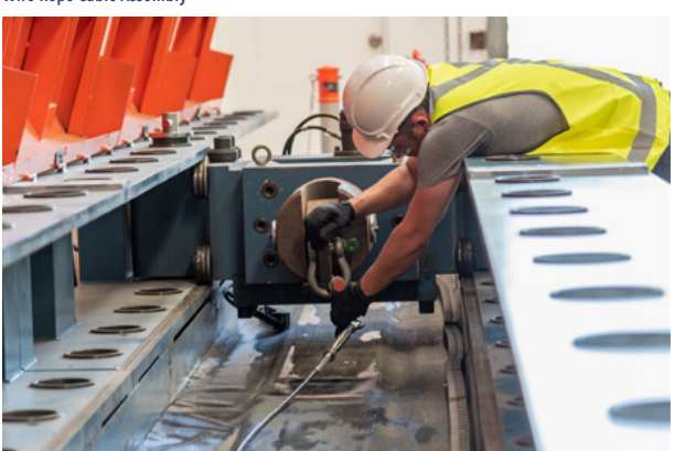
Wire Rope Testing