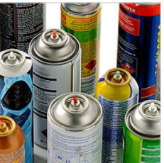
Hairspray, insect spray, Aerosols