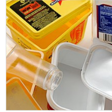
Marg, butter, sauce, dressing containers