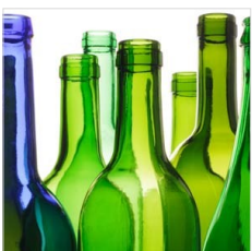
Wine & Alcohol bottles (no lids)