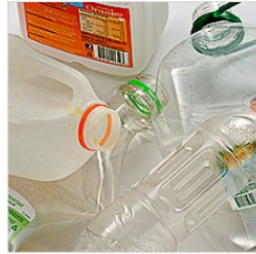
Plastic milk/ juice bottles