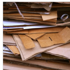
Cardboard, egg cartons