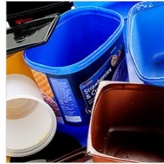
Ice cream, yoghurt tubs