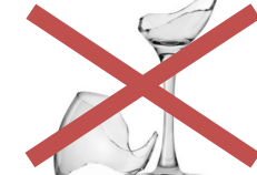
Broken/unbroken glasses & crockery