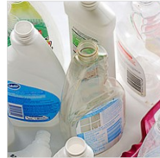
Cleaning product bottles