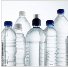
Plastic water bottles (no lids)

What goes in the Yellow Lid Wheelie Bin? PLEASE RINSE IF NEEDED & REMOVE ALL LIDS/NOZZLES