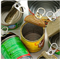
Aluminium food cans