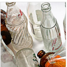
Glass bottles (no lids)