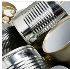
Steel food cans