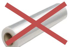
Cling wrap, soft plastics, bubble wrap