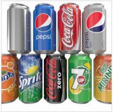
Aluminium drink cans