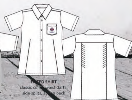
FITTED SHIRT classic collar, waist darts, side splits, action back