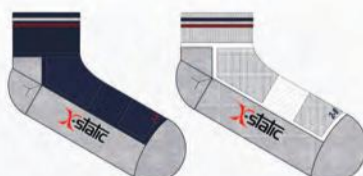
SHORT DAY SOCKS 40mm low cut length x-static anti odour fibre with garnet & navy stripes