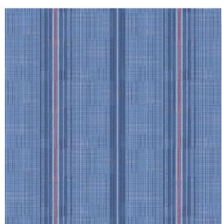
SUMMER DRESS FABRIC