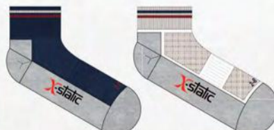
SHORT DAY SOCKS 40mm low cut length x-static anti odour fibre with garnet & navy stripes