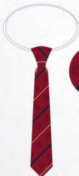
CRESTED LOOP TIE shadow crest & stripe design

Perm-A-Pleat Schoolwear THESE DESIGNS ARE EXCLUSIVE TO PERM-A-PLEAT SCHOOLWEAR AND MAY NOT BE REPRODUCED IN ANY FORM