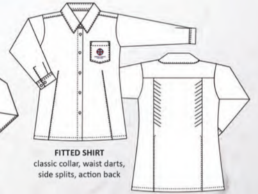
FITTED SHIRT classic collar, waist darts, side splits, action back