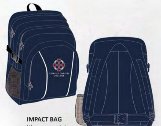
IMPACT BAG with screenprint