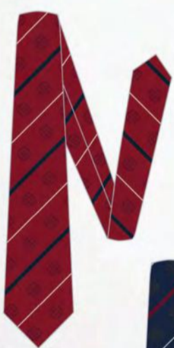
CRESTED TIE shadow crest & stripe design

Perm-A-Pleat Schoolwear THESE DESIGNS ARE EXCLUSIVE TO PERM-A-PLEAT SCHOOLWEAR AND MAY NOT BE REPRODUCED IN ANY FORM