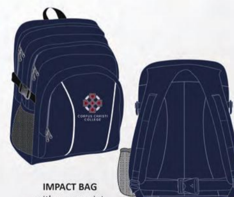
IMPACT BAG with screenprint