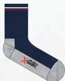
LONG DAY SOCKS 3/4 length x-static anti odour fibre with garnet & white stripes