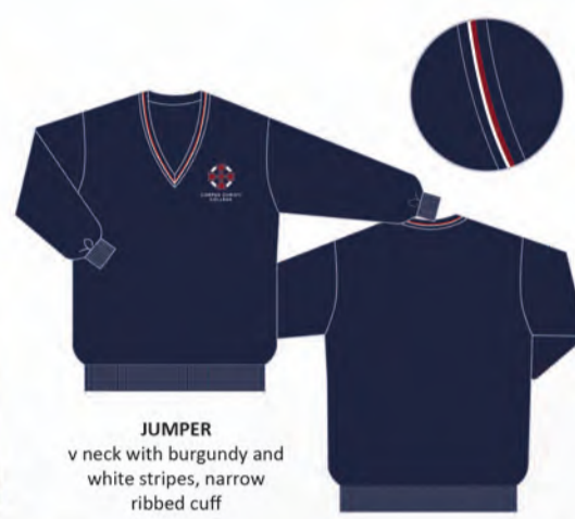
JUMPER v neck with burgundy and white stripes, narrow ribbed cuff