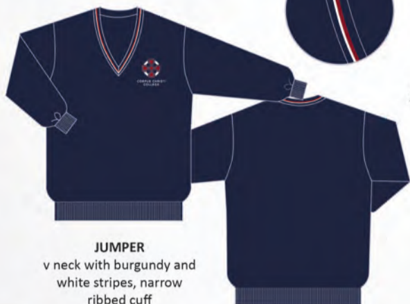
JUMPER v neck with burgundy and white stripes, narrow ribbed cuff