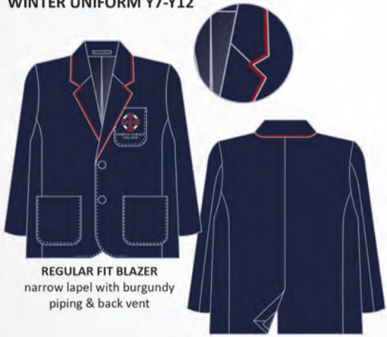
REGULAR FIT BLAZER narrow lapel with burgundy piping & back vent