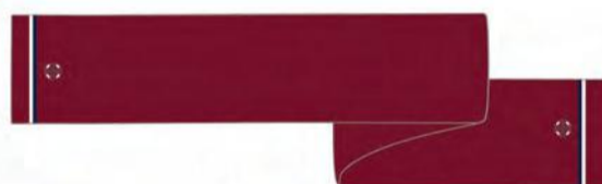
SCARF burgundy with white & navy stripes