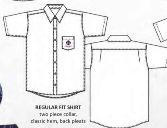
REGULAR FIT SHIRT two piece collar, classic hem, back pleats