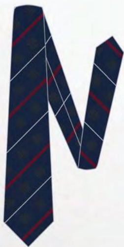
PREFECTS TIE shadow crest & stripe design