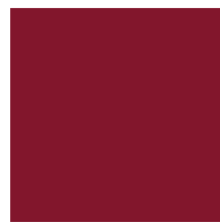
CORPUS CHRISTI BURGUNDY