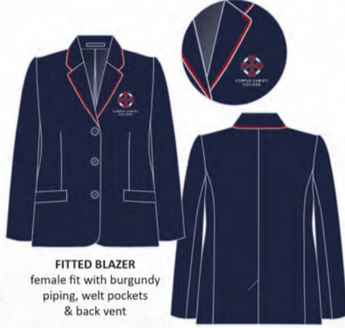
FITTED BLAZER female fit with burgundy piping, welt pockets & back vent