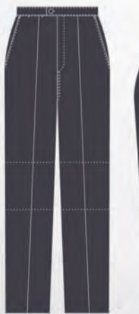
SINGLE PLEAT TROUSER ELASTIC BACK double knee, slant pockets,