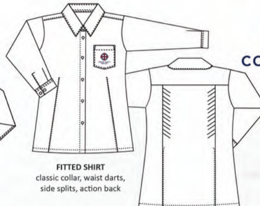
FITTED SHIRT classic collar, waist darts, side splits, action back