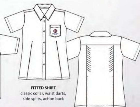
FITTED SHIRT classic collar, waist darts, side splits, action back