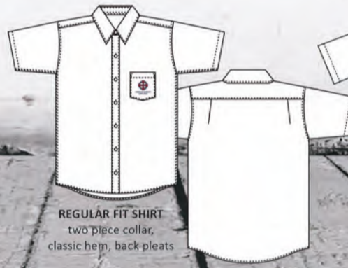
REGULAR FIT SHIRT two piece collar, classic hem, back pleats