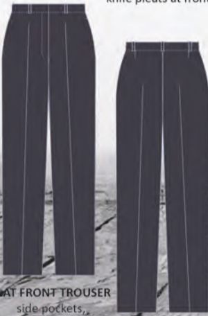
FLAT FRONT TROUSER side pockets, internal adjustable waistband