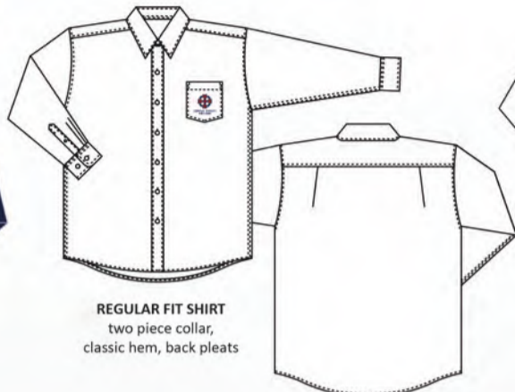
REGULAR FIT SHIRT two piece collar, classic hem, back pleats