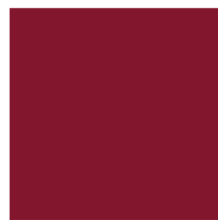
CORPUS CHRISTI BURGUNDY