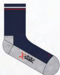
LONG DAY SOCKS 3/4 length x-static anti odour fibre with garnet & white stripes