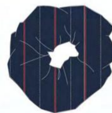
WINTER SCRUNCHIE skirt stripe fabric