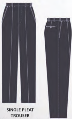
SINGLE PLEAT TROUSER flexi-fit waistband,