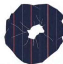
WINTER SCRUNCHIE skirt stripe fabric