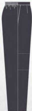
FLAT FRONT TROUSER side pockets, internal adjustable waistband