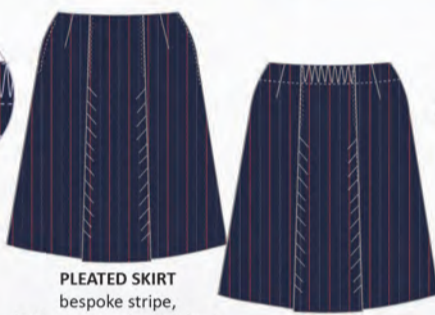
PLEATED SKIRT bespoke stripe, knife pleats at front & back