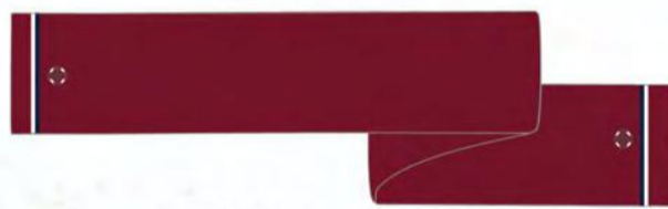
SCARF burgundy with white & navy stripes