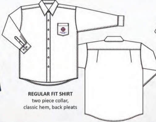
REGULAR FIT SHIRT two piece collar, classic hem, back pleats