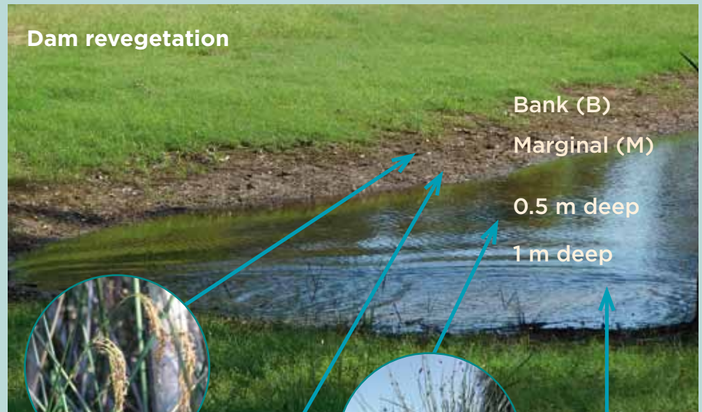
Bare Twig Rush Baumea juncea