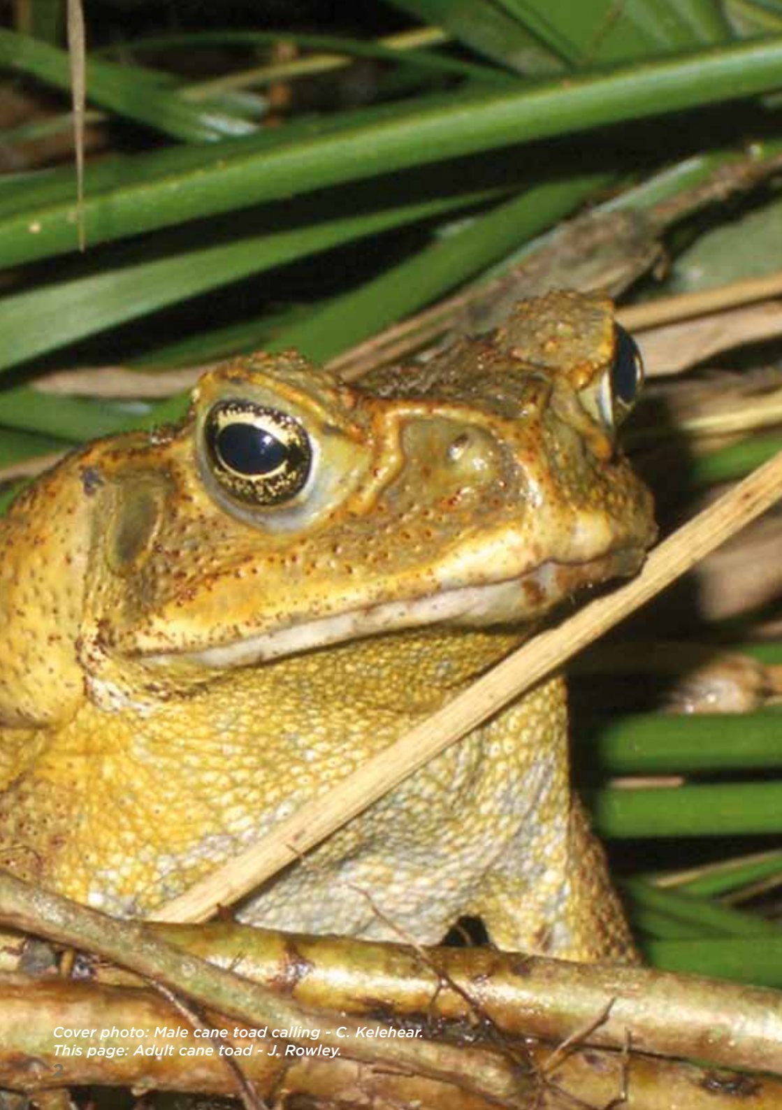
Cover photo: Male cane toad calling. This page: Adult cane toad.