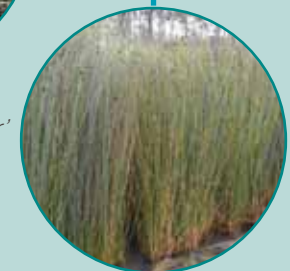
Grey Sedge Lepironia articulata