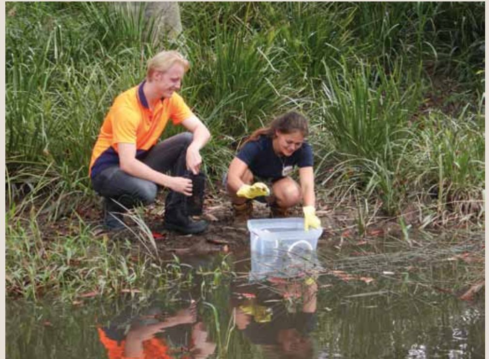
Traps are placed at the edge of the water body where tadpoles aggregate. Do not set traps if cane toad tadpoles are not known to be present.