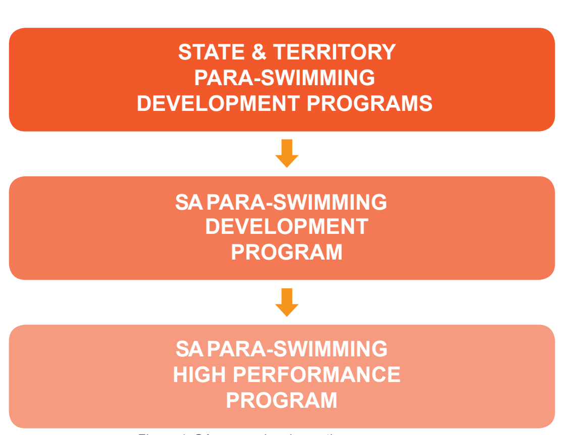
Figure 1: SA para-swimming pathways programs

The Paralympic Performance Pathway programs include the State & Territory development programs and the SA Development Program. High performing athletes then progress through to the SA Para Performance programs and ultimately Australian Dolphins swim team selection.