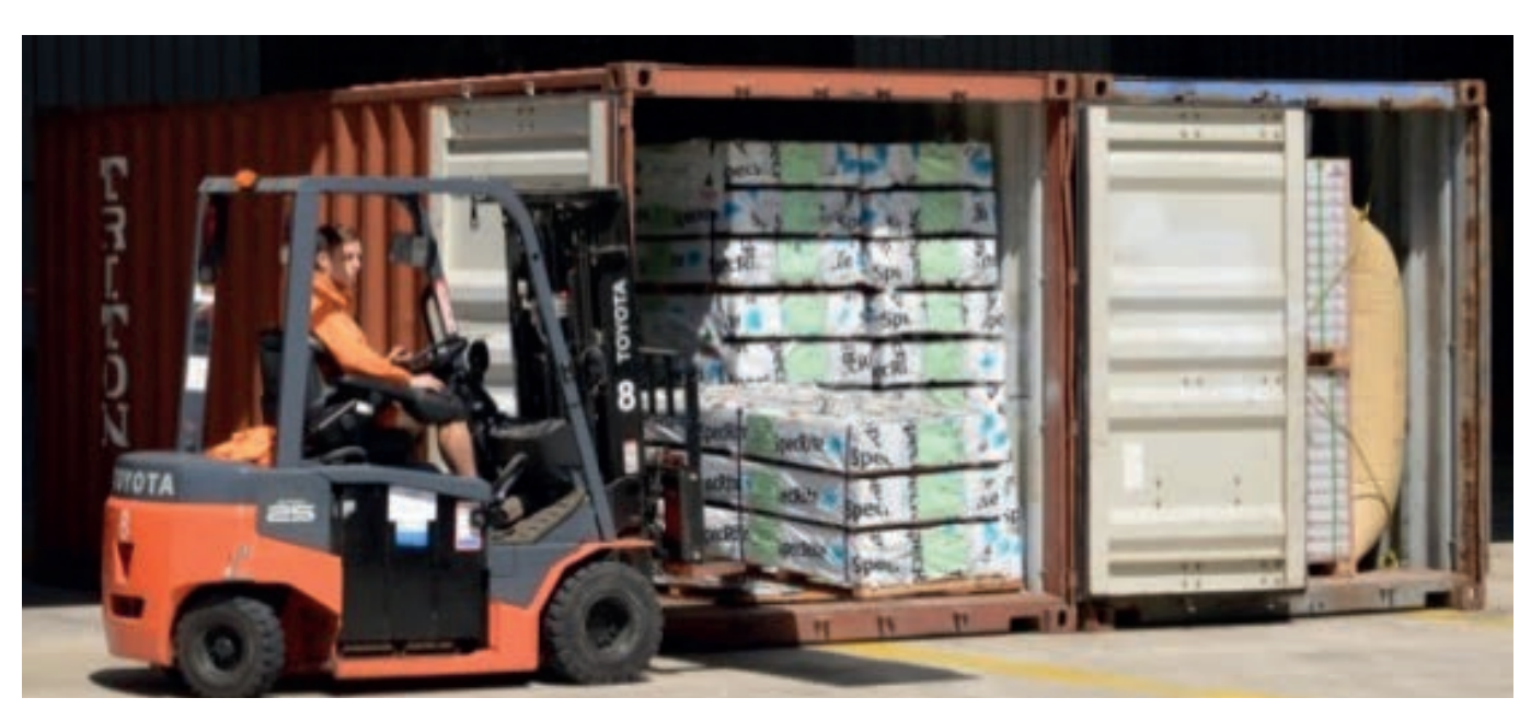
Figure 2: Ensure the container is placed on even ground.