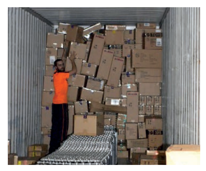
Figure 6: Using a manually operated conveyor.