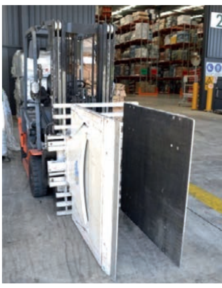
Figure 7: Using suitable equipment to unload such as a fork lift truck with grabs.