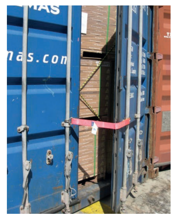
Figure 3: Use restraints to ensure doors can be opened safely.