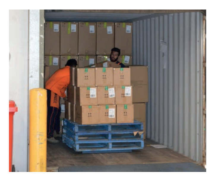
Figure 5: Stack boxes onto pallets for removal by forklift truck.