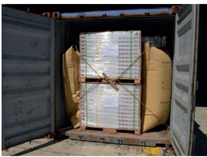
Figure 4: Bulky items packed using crates, wrapping, dunnage bags and strapping.