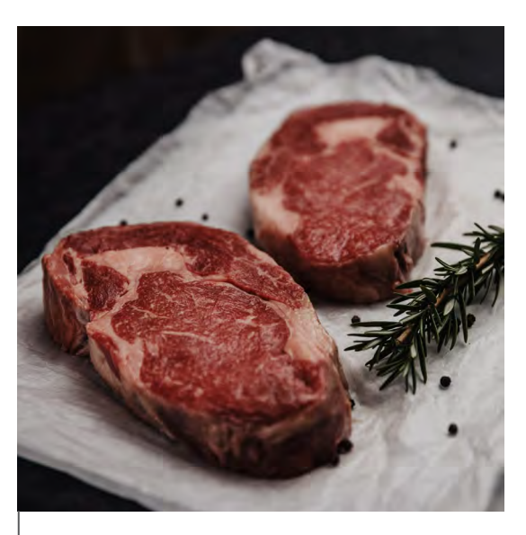
Tasmanian beef is prized in the US and Asian markets.

Tasmanian farmers supply close to 40 per cent of global medicinal opiates.