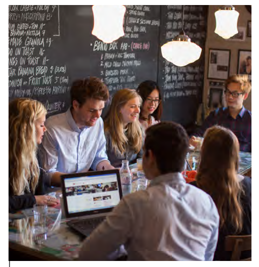
Tasmania provides an exceptional education experience with friendly and welcoming communities.

Tasmania is home to one of the world's most efficient zinc producers.