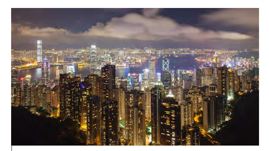
Tasmania has dedicated in-market presence in China and Hong Kong SAR.

The Tasmanian Government will focus assistance on our high growth sectors, where we have globally recognised products and expertise. We will deliver an integrated suite of services across sector strategies and marketing plans. We will also look for opportunities to partner with appropriate organisations or initiatives which will allow us to maximise our outcomes and increase our return on investment. Matching Tasmanian business with appropriate international buyers is vital to success of the trade strategy. Our committed team of trade and sectorspecific specialists will work closely with Austrade, the Department of Foreign Affairs and Trade (DFAT) and other organisations to provide this important service for Tasmanian businesses.