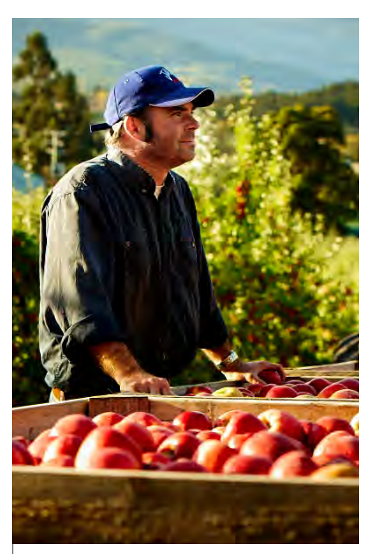
Our fertile soils and abundant water resources are ideal for vegetable and fruit production.