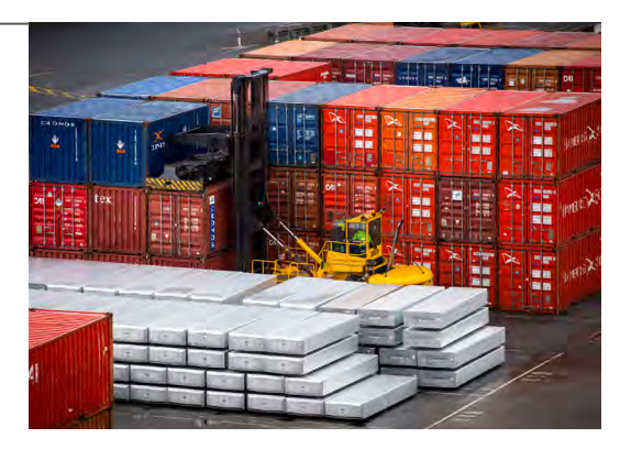
Photo (left): Tasmania's north west is the centre for globally competitive heavy vehicle production.

International freight connections have been enhanced through new shipping, including the nation's largest Australia-flagged cargo vessel.