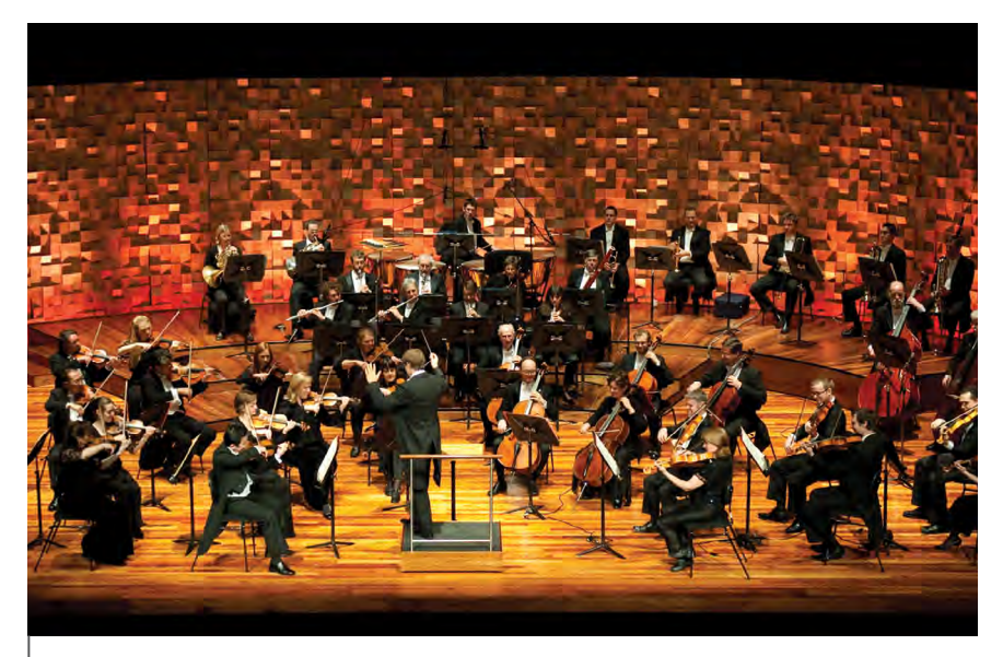
The Tasmanian Symphony Orchestra has toured numerous countries and welcomes cultural exchanges.

The Tasmanian Government supports and facilitates a number of cultural exchange opportunities which help to foster international relations through directly linking members of the community with their overseas counterparts. Projects that encourage direct people-to-people connections have the capacity to build cultural understanding between Tasmania and the rest of the world, which is an important adjunct to the government's wider international trade aims and objectives.