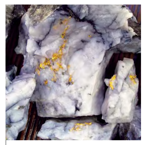
Tasmania has a long history of exporting zinc, copper, magnetite and other ores.

Photo (left): Approximately 90 per cent of Tasmania's energy is derived from clean renewable sources.