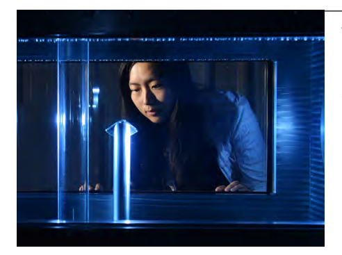
We are international leaders in agricultural, maritime, aquaculture and genetic science.