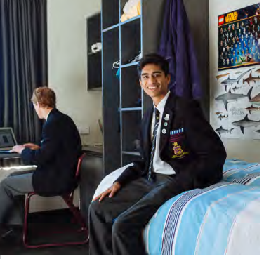
Modern facilities complement our world class education offering.