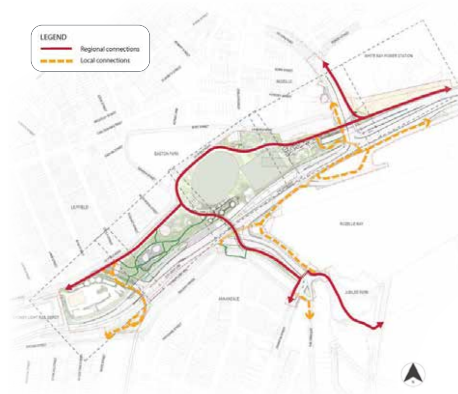
Figure 6: Cycling and pedestrian paths map