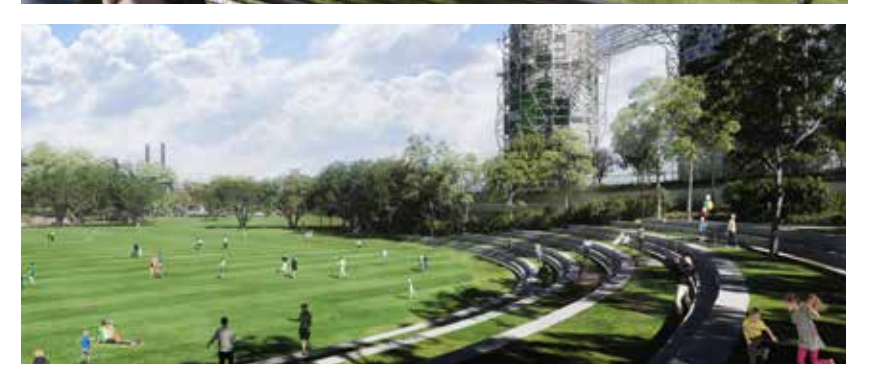
Figures 11 -14 Artist's impressions of the future use of the Rozelle Parklands