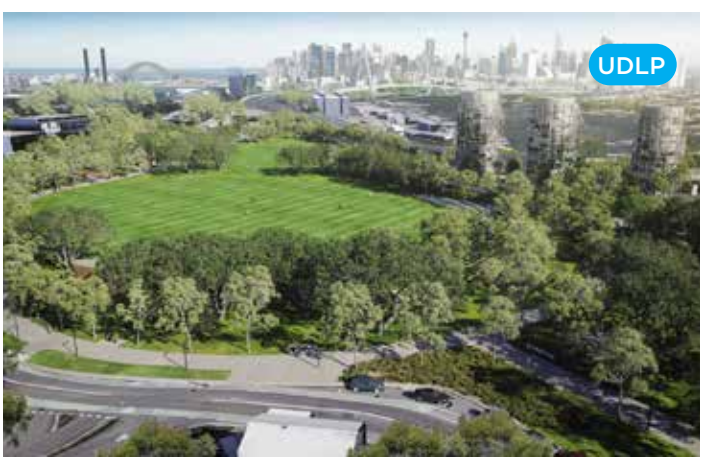
Figure 4-5: EIS Design compared with UDLP