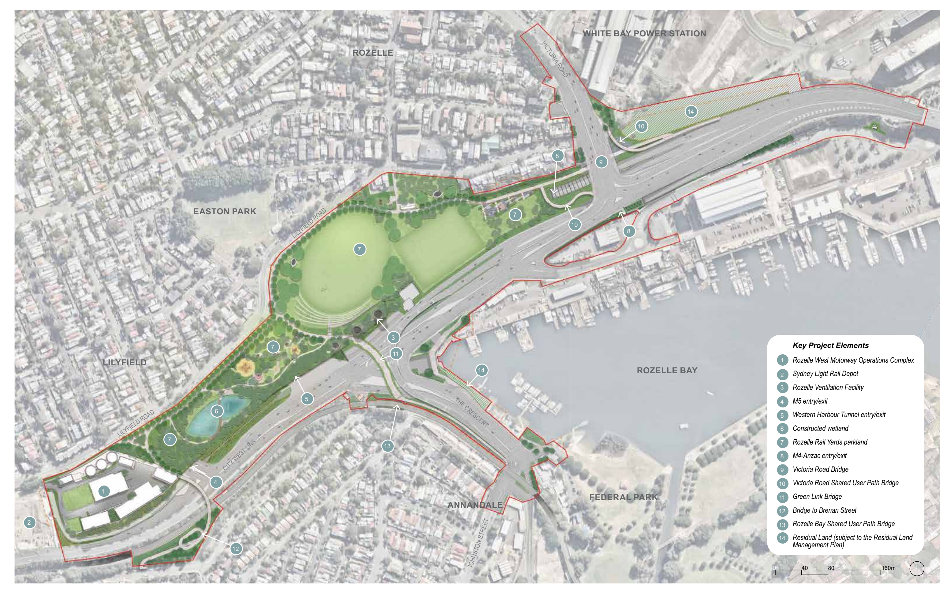
Figure 1: Rozelle -Landscape Concept Masterplan